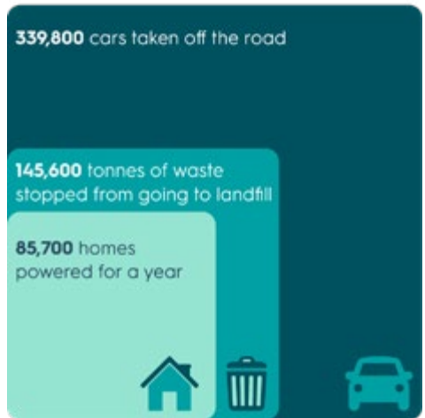
Figures are correct as of June 2021

Our climate-aware funds have helped reduce our members' carbon footprint by the equivalent of: